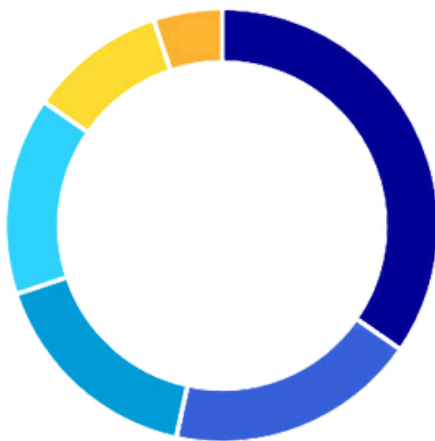
Primary Role/Job Title